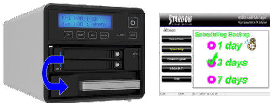
Backup on demand

It can be directly inserted into the third hard disk to rebuild the hard disk data immediately. When the data reconstruction is completed, your data will immediately form 2 identical full backups.